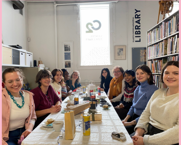
C2 holiday staff party, December 2022