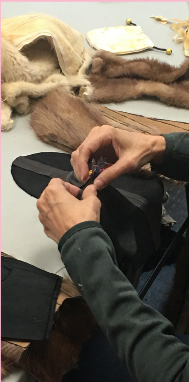
Warm Hands Warm Hearts workshop

Back by popular demand was the Online Summer Maker Challenge , regular invitations to get crafty around a given concept and post the results on social media.