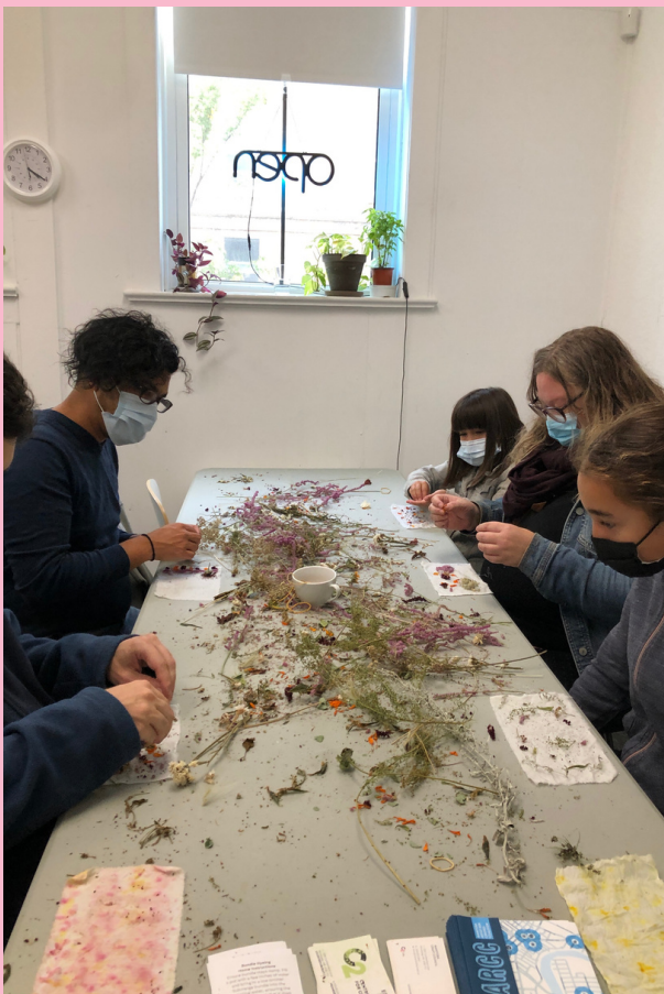
Nuit Blanche at C2, Eco-printing Maker Table

To promote, develop, and advocate for contemporary craft and its makers in Manitoba.