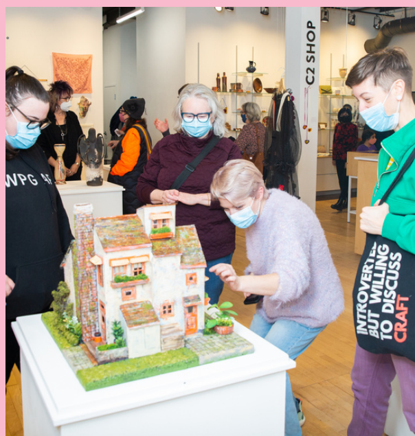
Craft in Colour exhibition