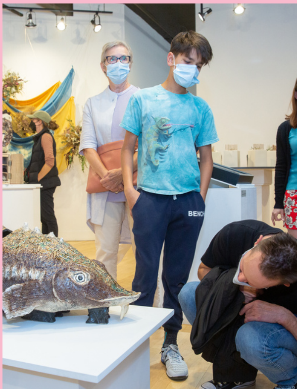
Eco-Craft exhibition

This was an exciting year of exhibitions in the Shirley Richardson Craft Gallery: