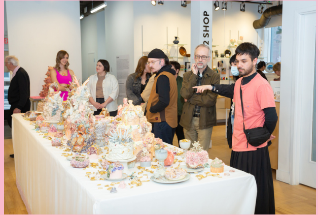
Stuffed exhibition