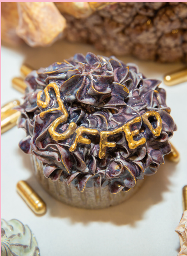
Stuffed exhibition

Canada Summer Jobs Winnipeg Arts Council Young Canada Works/ Student Work Placement Winnipeg Foundation