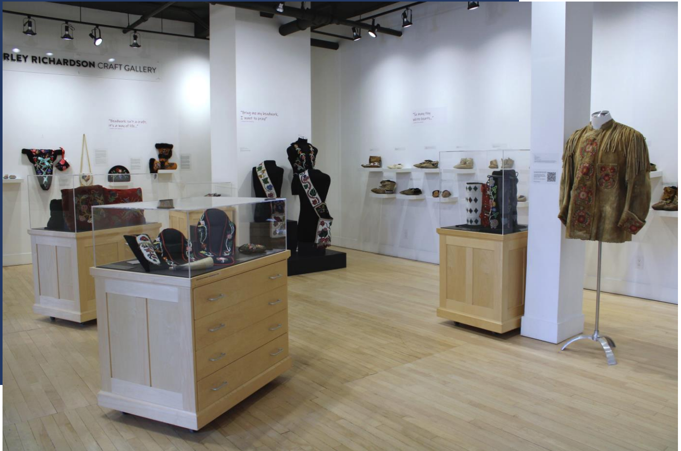
mámawihitowin | Ganaagishkwadaadiwin | Asenbli | Rencontre | Gathering On exhibit March and April 2023