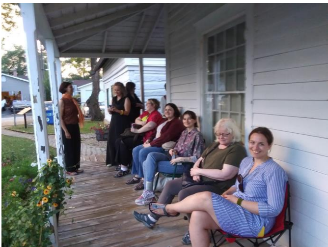
2023 C2 Volunteer Appreciation Hosted at Seven Oaks House Museum