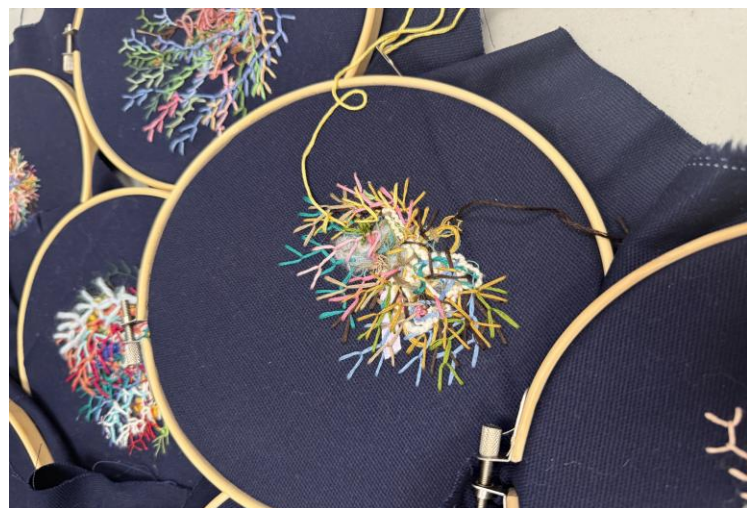
Caribou Moss Embroidery Workshop creations.