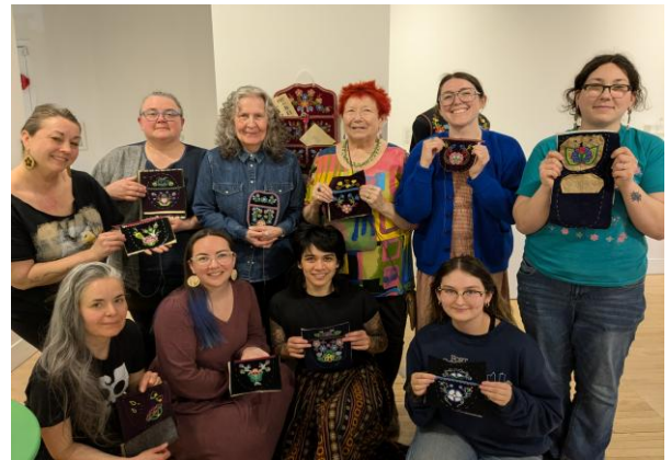
Beaded Wall Pocket Workshop Participants